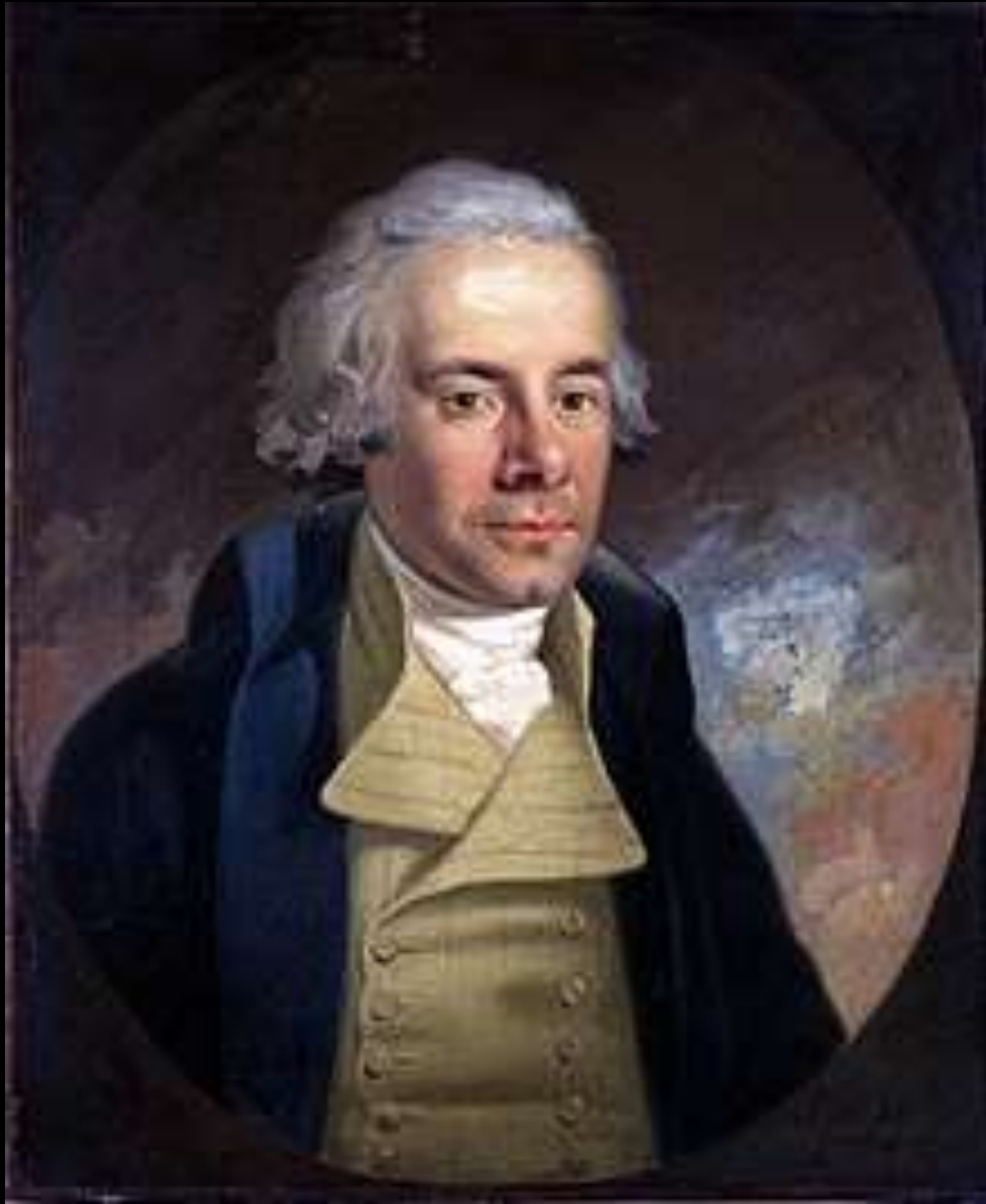
William Wilberforce 1759 – 1833